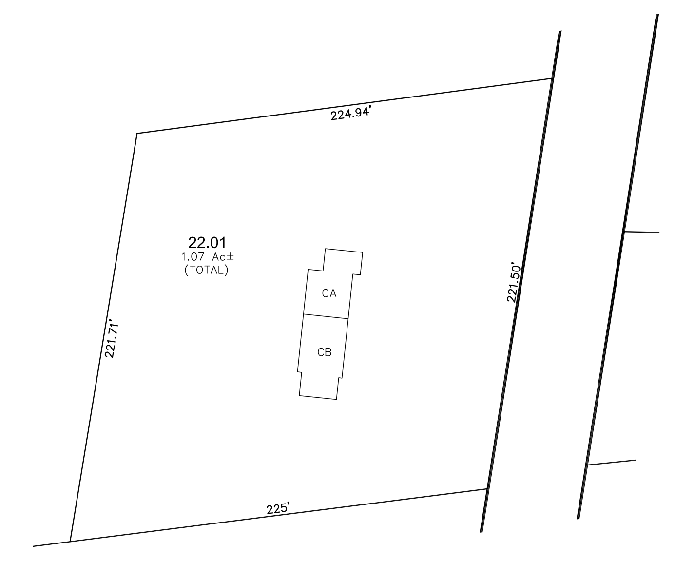
DETAIL "A" SCALE: 1" = 50'