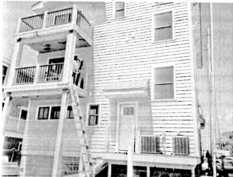
DATE: June 17, 2014 – Rear View