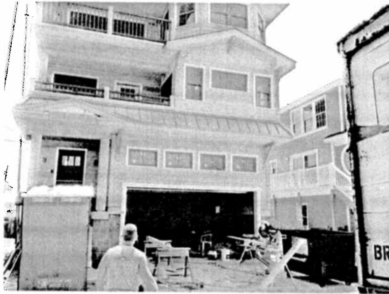
DATE: June 17, 2014 – Front View

If using the Elevation Certificate to obtain NFIP flood insurance, affix at least two building photographs below according to the instructions for Item A6. Identify all photographs with: date taken; "Front View" and "Rear View"; and if required, "Right Side View" and "Left Side View". If submitting more photographs than will fit on this page, use the Continuation Page, following.