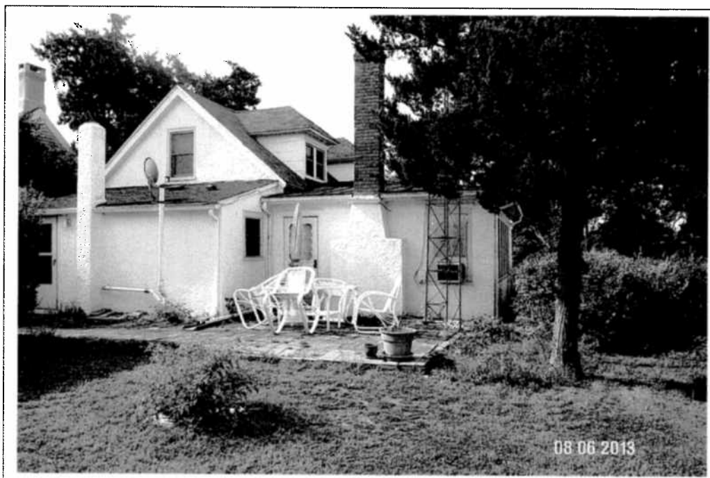
DATE: AUGUST 06, 2013, REAR VIEW OF RESIDENCE