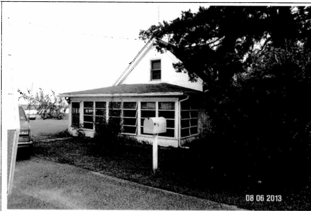
DATE: AUGUST 06, 2013, FRONT VIEW OF RESIDENCE

If using the Elevation Certificate to obtain NFIP flood insurance, affix at least 2 building photographs below according to the instructions for Item A6. Identify all photographs with date taken; "Front View" and "Rear View"; and, if required, "Right Side View" and "Left Side View." When applicable, photographs must show the foundation with representative examples of the flood openings or vents, as indicated in Section A8. If submitting more photographs than will fit on this page, use the Continuation Page.