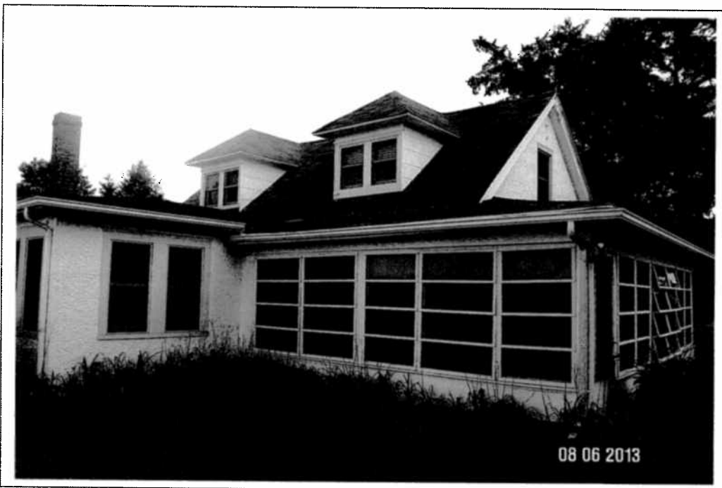
DATE: AUGUST 06, 2013, LEFT SIDE VIEW OF RESIDENCE

If submitting more photographs than will fit on the preceding page, affix the additional photographs below. Identify all photographs with: date taken, "Front View" and "Rear View"; and, if required, "Right Side View" and "Left Side View." When applicable, photographs must show the foundation with representative examples of the flood openings or vents, as indicated in Section A8.